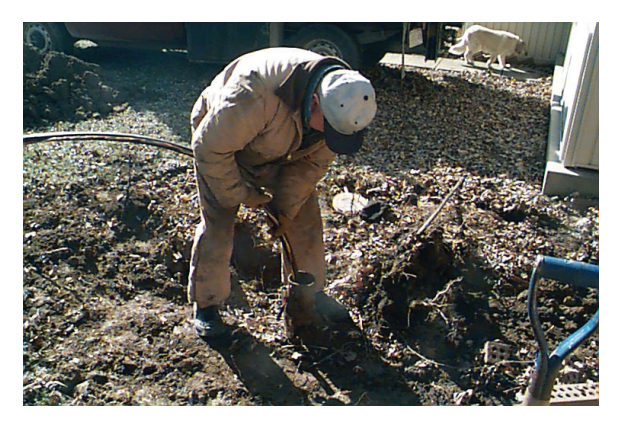
Pump being removed from a well by a licensed driller/pump installer prior to plugging.

with impervious grouting material as specified in 312 IAC 13. A well that poses a hazard to human health must be plugged with impervious grouting material. Large-diameter hand-dug or bucketexcavated wells must be covered at the surface with a reinforced concrete slab or a treated wood cover protected by water-repelling material such as roofing. The Division of Water recommends that the well also be completely filled with clean earth and impervious grouting materials as specified in 312 IAC 13. Sealing or plugging a water well may be difficult. Before attempting the iob. a landowner should contact the Division of Water or read the Purdue University Cooperative Extension Water Quality publication "Plugging Abandoned Water Wells: A Landowner's Guide" (WQ-21). This guide, written in cooperation with the Division of Water, is available online in PDF format from the Purdue Extension web site at https://mdc.itap.purdue.edu. Search for it under Natural Resources/Water Quality and Supply. WQ-21-W gives step-by-step instructions on how to seal, disinfect and plug abandoned water wells.